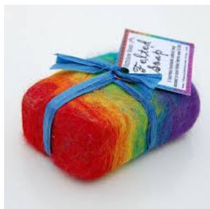
Felted Soap with Donna C