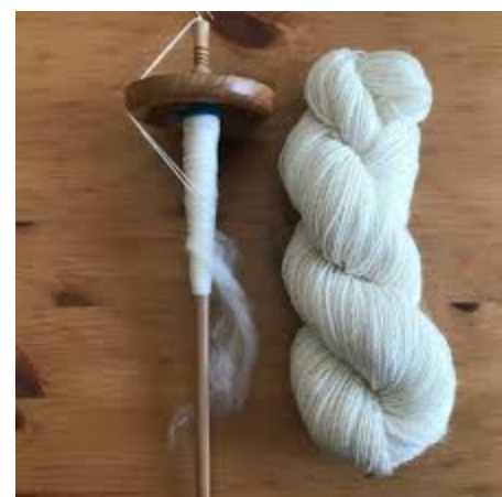
Drop Spindle with Juli H