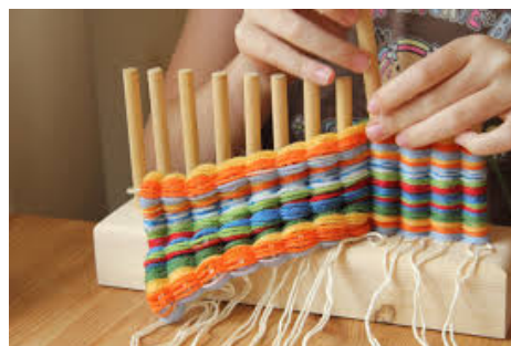
Peg Loom Weaving with Juli H